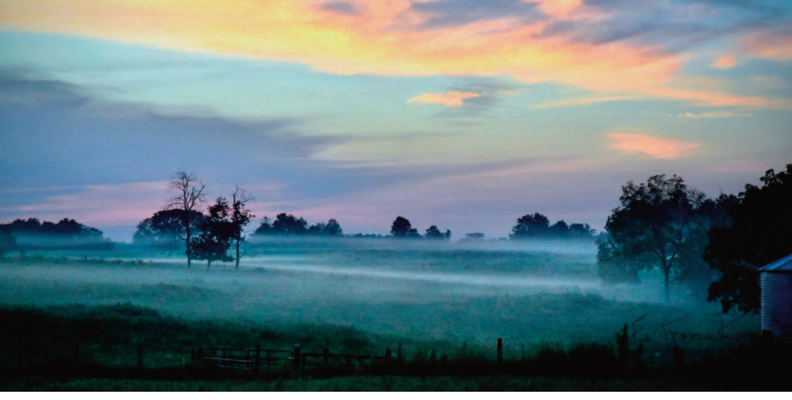
THE BERRY CENTER FARM AT SUNRISE.

Those of you familiar with the history of the Burley Tobacco Growers Cooperative that we study here at the Center, or any of the other price-support programs that came into being with the New Deal might be nodding along right now, and I'm sorry to say that the result of those programs ending will likely be repeated in India unless the protests are successful, and continue to be so in perpetuity. While it took us about a hundred years to get from 40% of the population farming to one percent, you can expect that consolidation to go much more quickly in South Asia due to the ever-increasing pace of technological advances and the sophistication of predatory economic development. Where this leaves the largest agricultural population on the planet is yet to be determined, though our own long, sad history of farm bankruptcies and vacant countryside, rural collapse and the diseases of despair that follow on after should be put forward as a cautionary tale. To those who might disagree, citing the endemic poverty or political corruption of the Indian subcontinent, well, we've got plenty of that here too, and neither situation can be blamed on the market providing too much for small farmers' wellbeing.