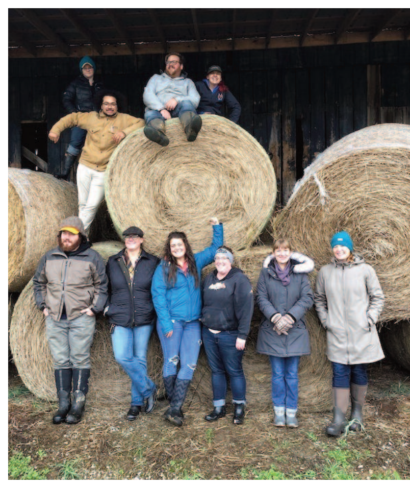
WBFP STUDENTS AT THE BERRY CENTER FARM AFTER A RURAL LITERATURE CLASS SESSION.

To this end, students work with neighboring farmers, economists, advocacy groups, and The Berry Center staff. Much of our work and learning takes place on The Berry Center Farm, a 200-acre parcel of land in Port Royal, Kentucky, which is ideally suited for grass farming and diversity of livestock. The farm has 50 acres of woodland that will benefit from a "worst-first" management plan aimed to improve the health