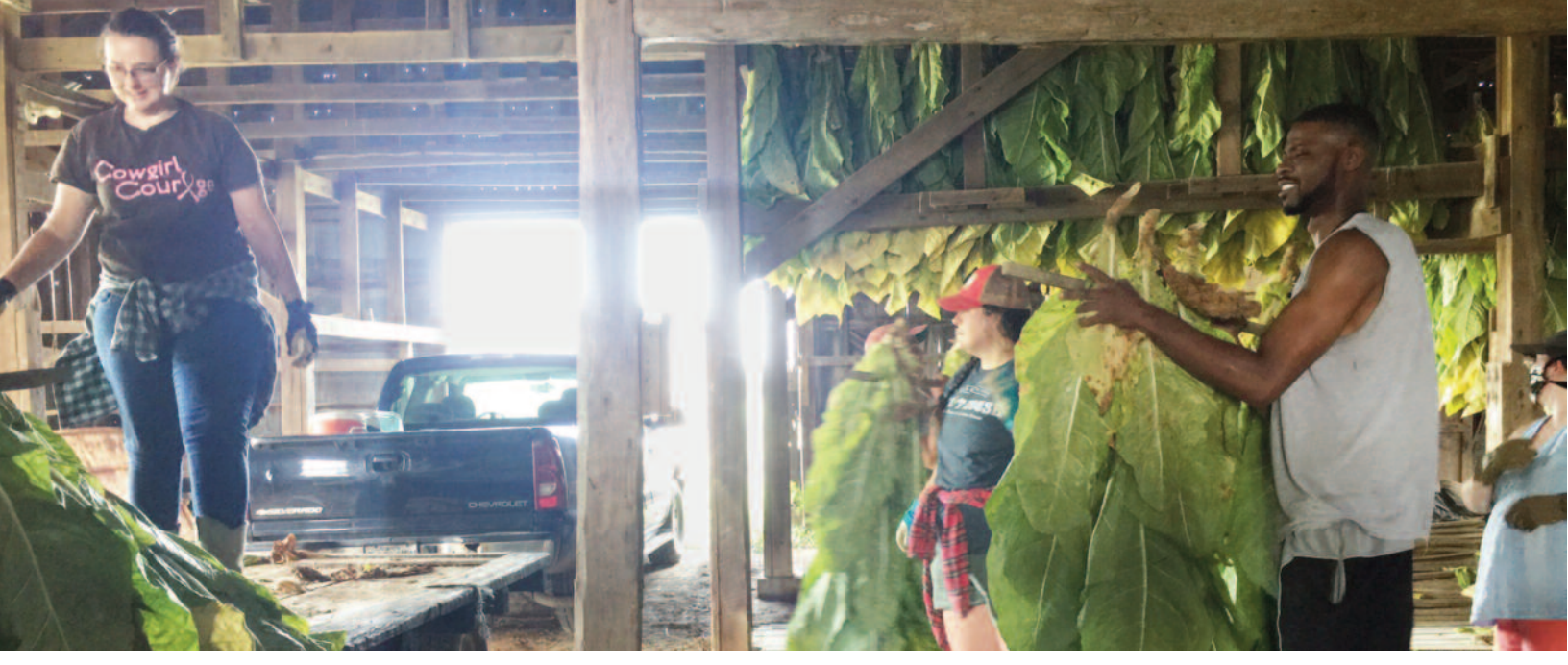
WBFP STUDENTS HOUSING TOBACCO AT A LOCAL FARM.

We are looking for people to join us in this good work, folks who: