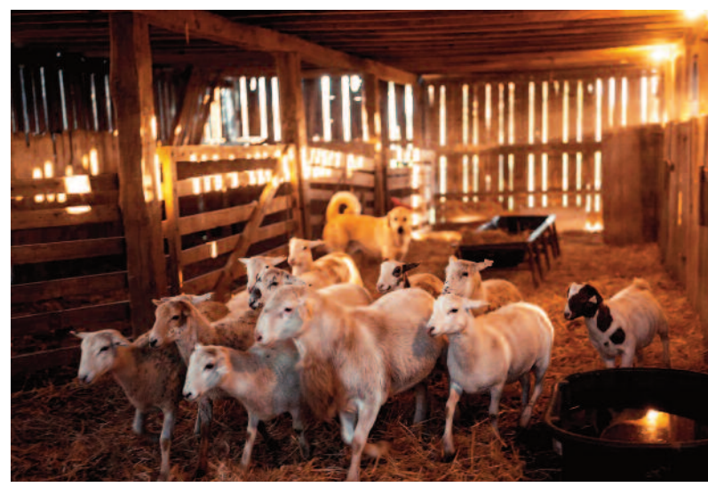
WBFP'S KATAHDIN SHEEP FLOCK AT THE BERRY CENTER FARM

made all the difference to me, to my family, and to our staff. My father has said, and I have echoed, that our work is way out on the margins of the way things are now. You have strengthened us, helped us, supported us and it has made all the difference.