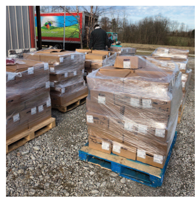
9,000 POUNDS OF HEALTHY ROSE VEAL READY TO BE DISTRIBUTED WITH HELP FROM CREATION GARDENS TO FEED JEFFERSON COUNTY FAMILIES THE DAY BEFORE CHRISTMAS EVE.