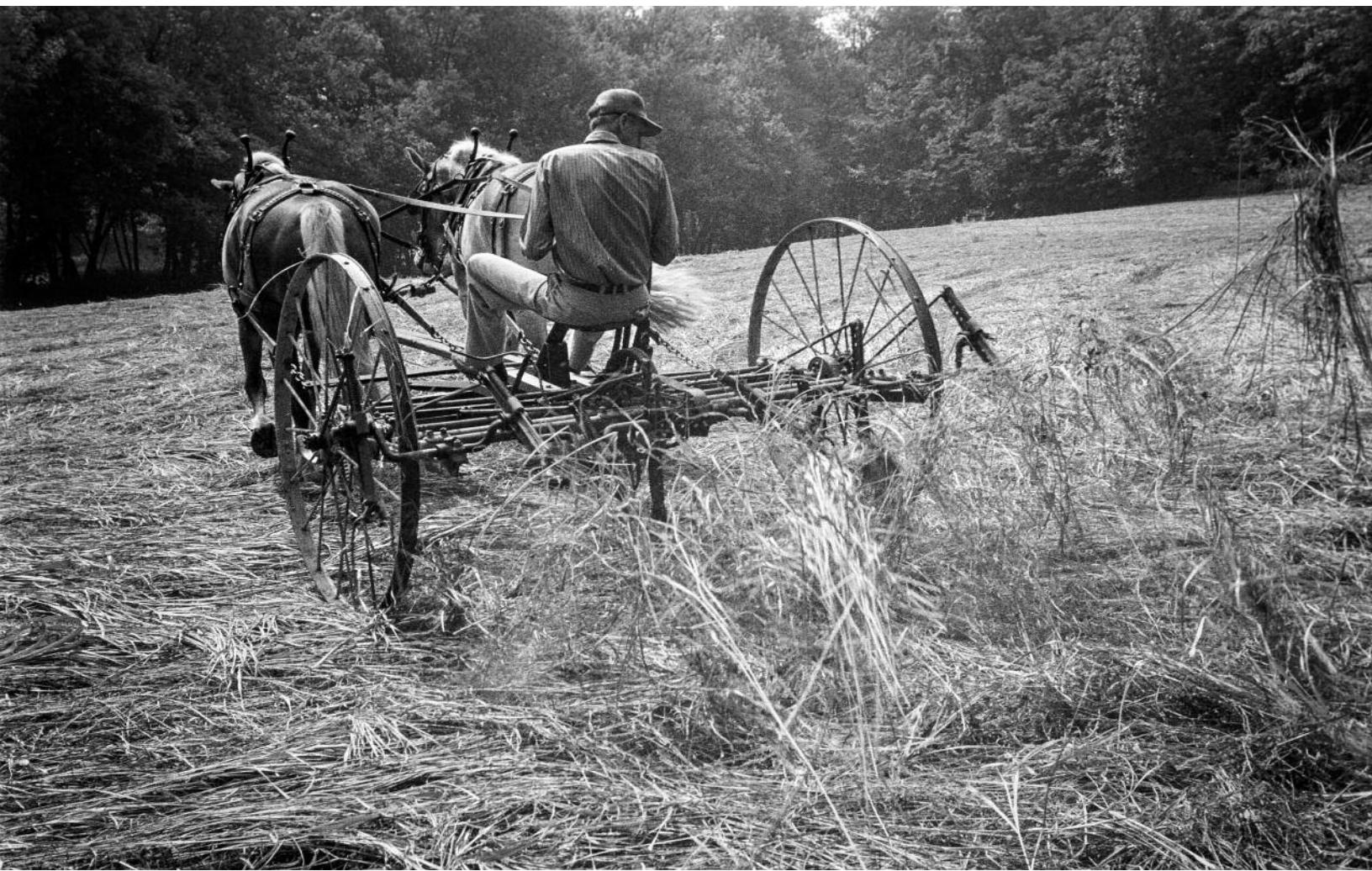
WENDELL BERRY TEDDING HAY. PHOTO BY TANYA AMYX BERRY, CIRCA 1979